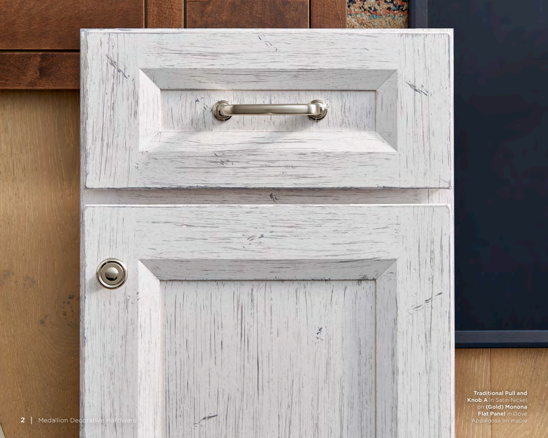
Traditional Pull and Knob A in Satin Nickel on (Gold) Monona Flat Panel in Dove Appaloosa on maple