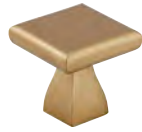
TRANSITIONAL KNOB F HW-449-SBZ Satin Bronze