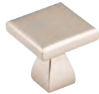
TRANSITIONAL KNOB F HW-449-SN Satin Nickel