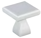
TRANSITIONAL KNOB F HW-449-PC Polished Chrome